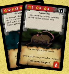
70 Dungeon cards 14 for each level