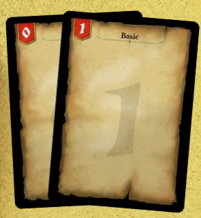
48 Basic cards 24 Basic 0 cards and 24 Basic 1 cards