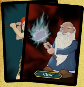
4 Hero cards depicting the 4 heroes