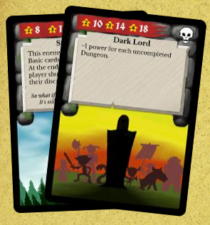
16 Boss cards4 cards for each of the4 different bosses