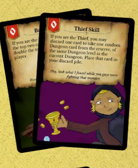
4 Skill cards 1 for each hero's special skill